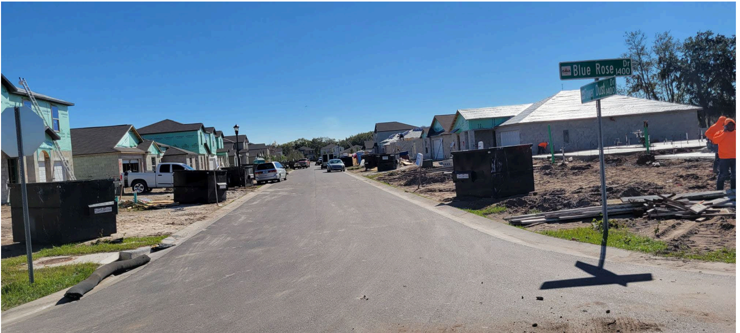
Construction progress on Flower Dust & Blue Rose Drive.