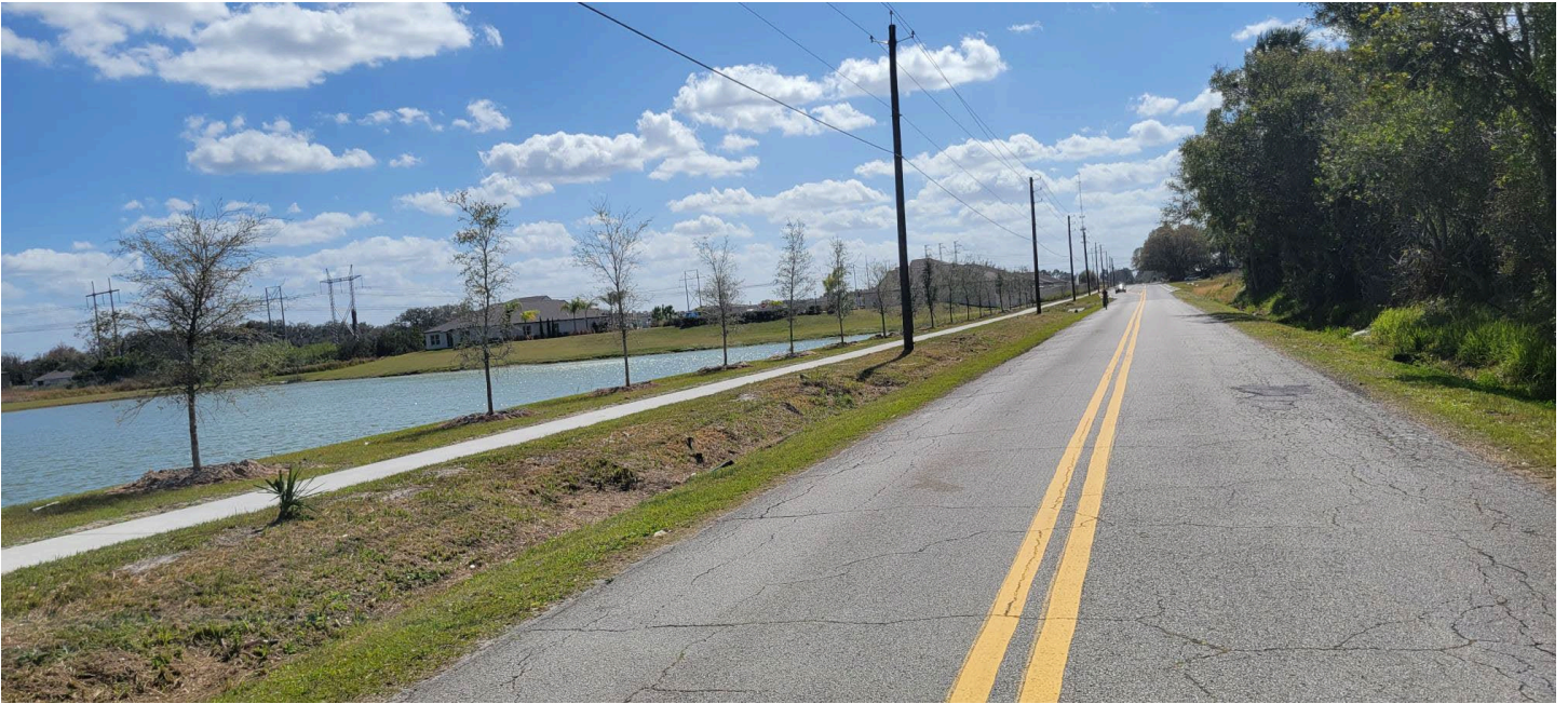
New Oak trees installed surrounding the pond on 15 th ST, SE