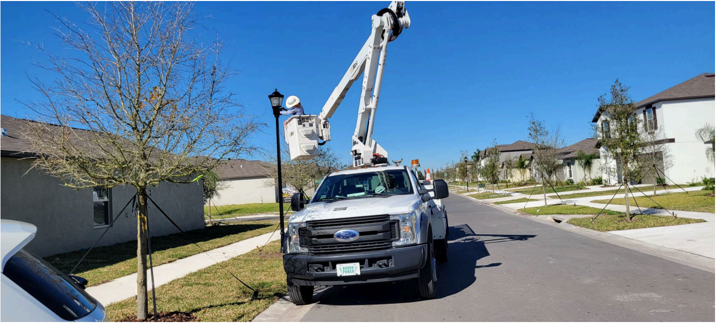
Lights being installed on Blue Rose Drive.