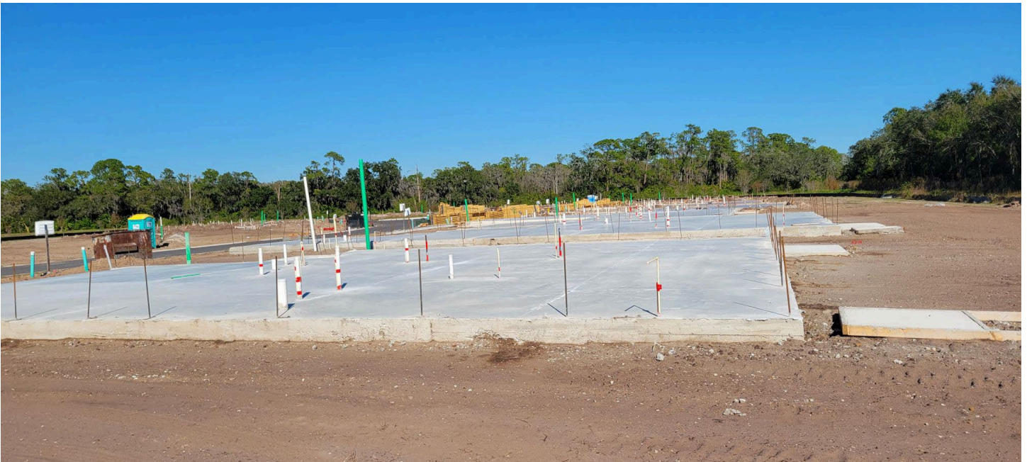
Concrete slabs going in on Fan Allow Way close to ponds 12 & 13 at the furthest SE section of Spencer Creek.