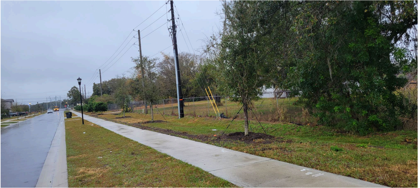
New Oak trees installed on the East side of Golden Glow.