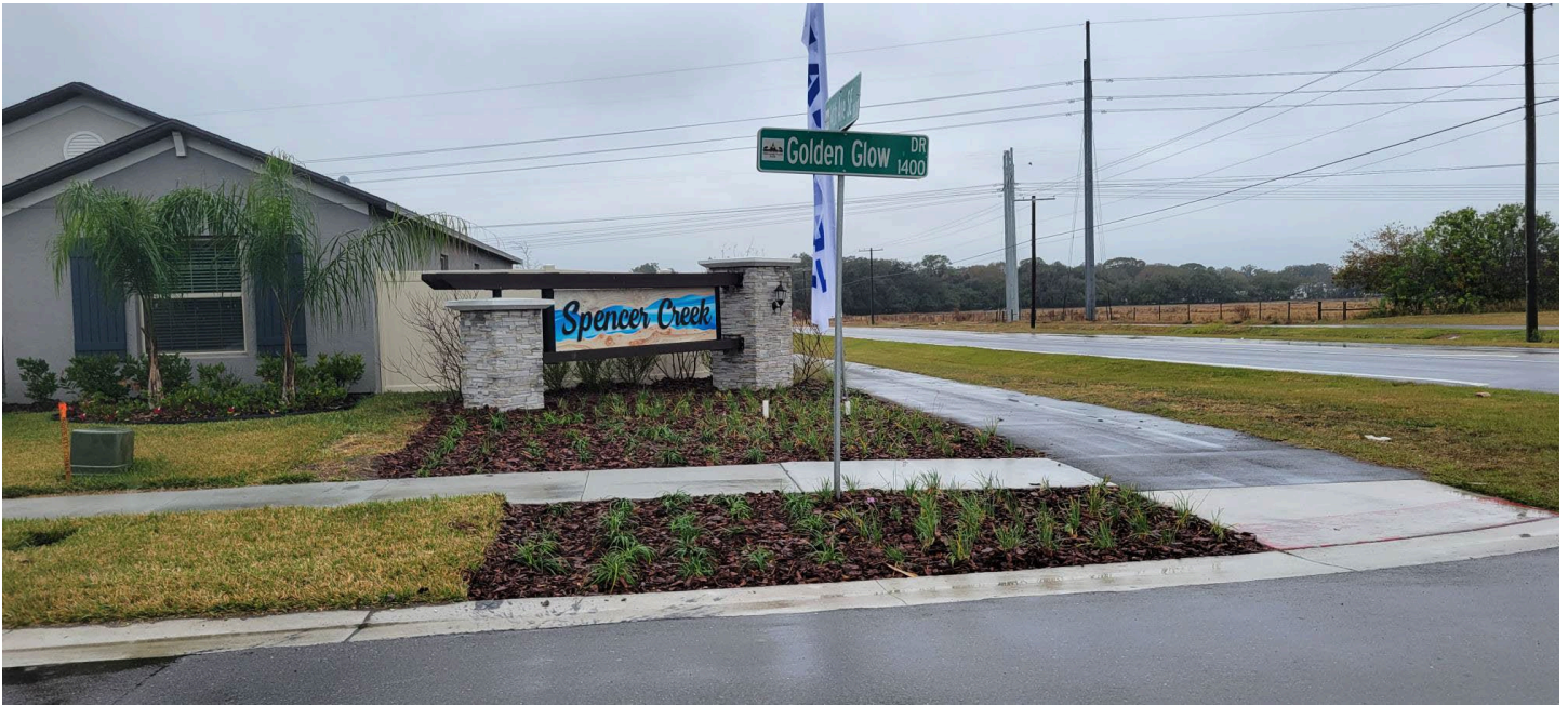
New Liriope plants installed on the West entrance of Golden Glow & 14TH, ST, SE.