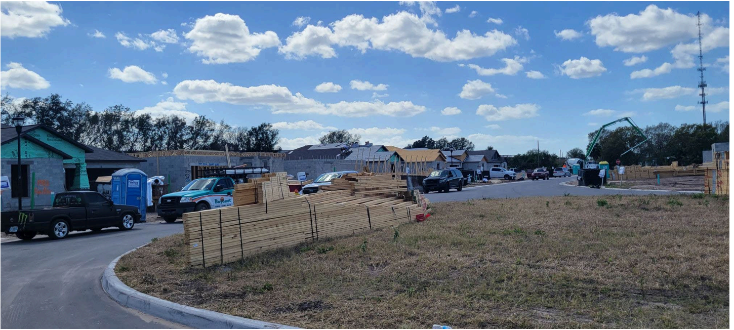
Construction progress on Fan Aloe Way.