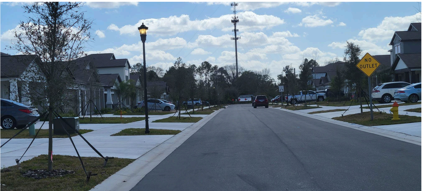
Lights are now fully functional on Silver Star Place.