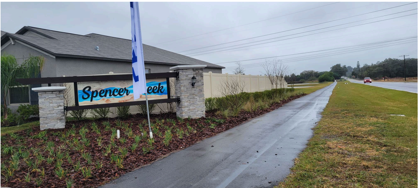
New Walter Viburnum & Crape Myrtle trees planted on 14TH ST, SE.