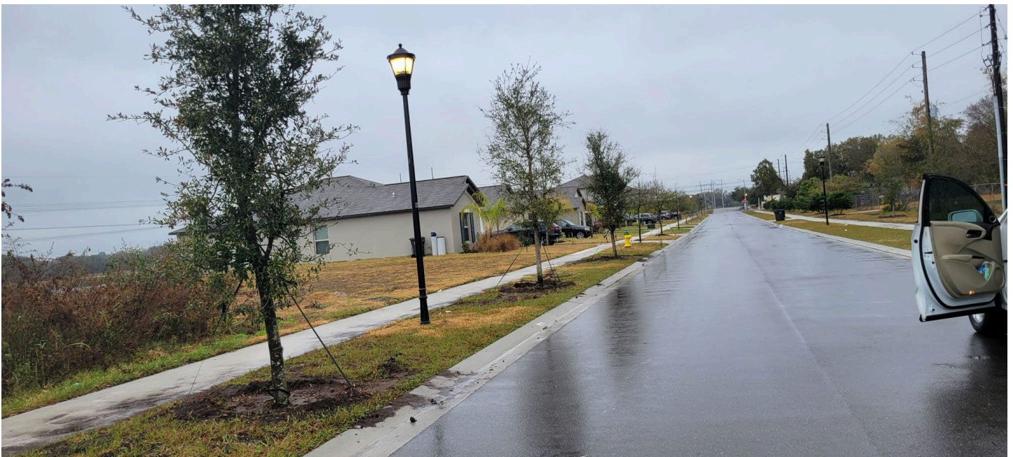
New Oak trees installed on the West side of Golden Glow