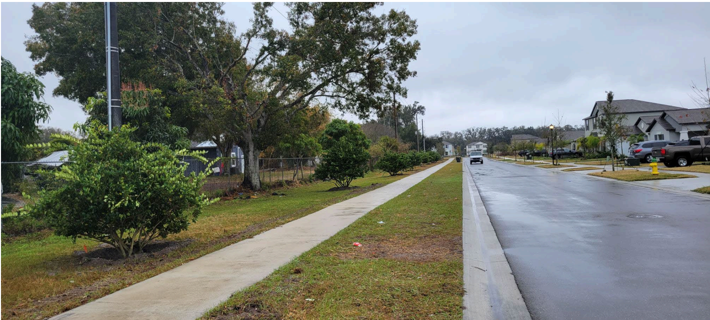
New Ligustrum trees installed on the East side of Golden Glow.