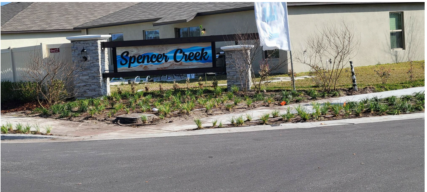
Liriope & Society Garlic was installed.