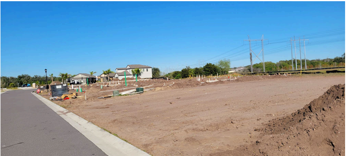
Site development on Tiger Tooth.