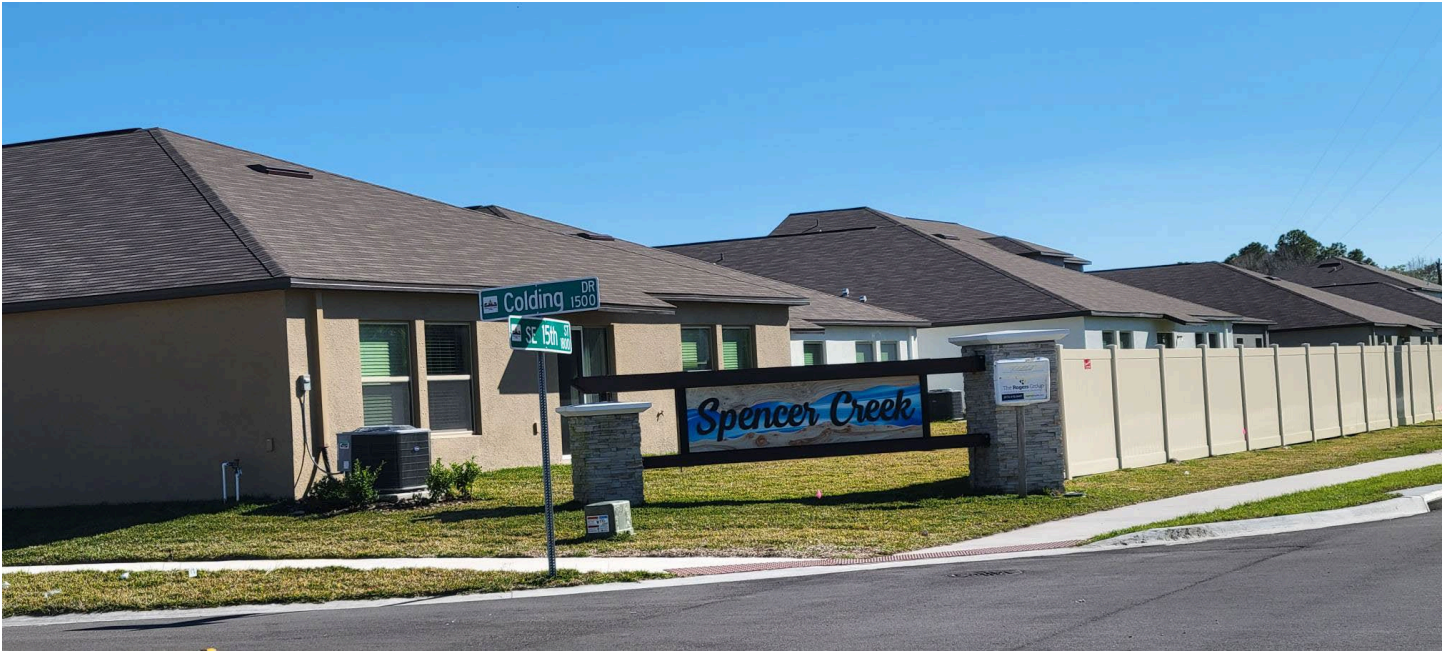
Entrance on Colding and 6 th ST, SE.