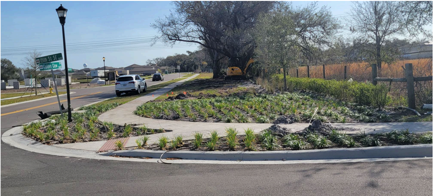
New landscaping on the 15 th St, SE entrances.