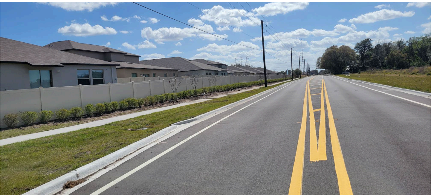
New Walter Viburnum & Crape Myrtle trees installed along fence line on 15 th ST, SE.