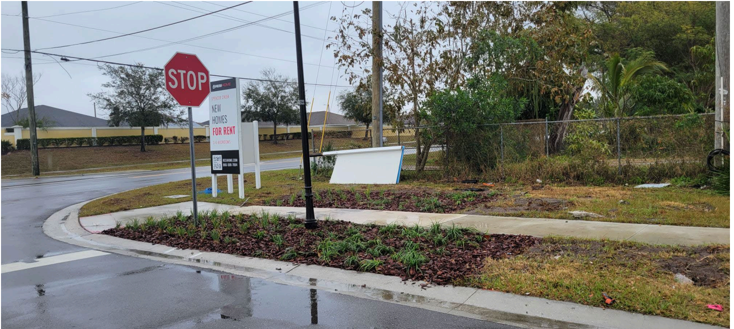
New Liriope plants installed on the East side of the Golden Glow & 14 ST, SE entrance.